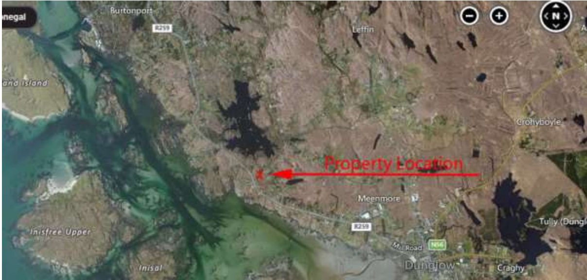
Aerial View of Property Location