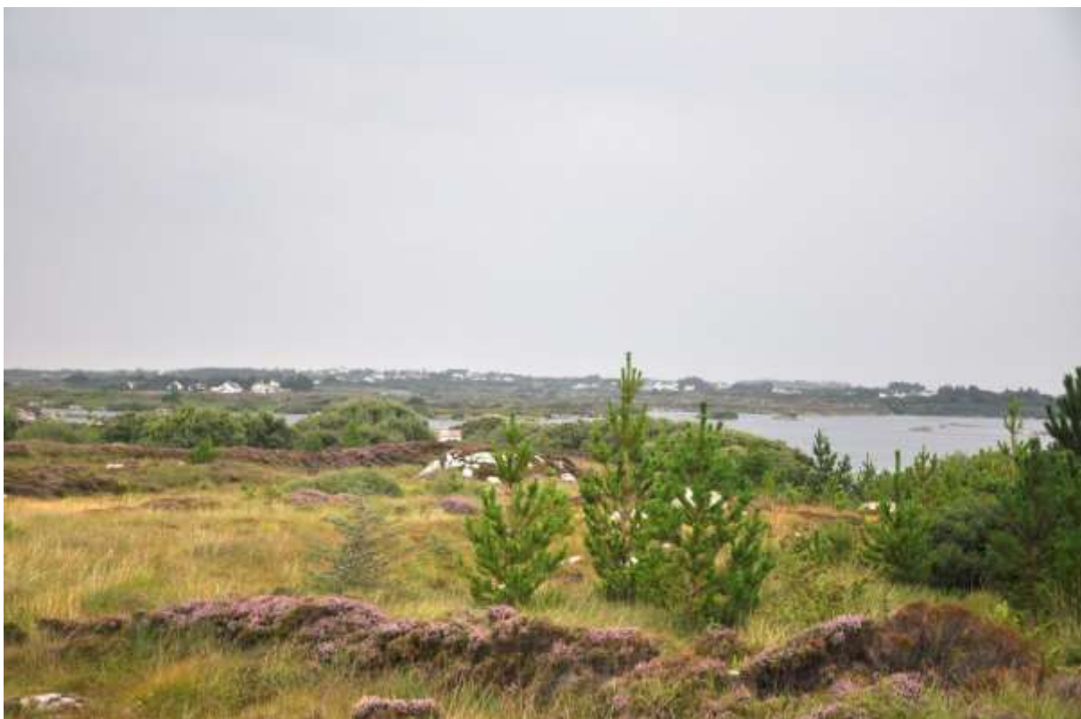
Lake View From Site