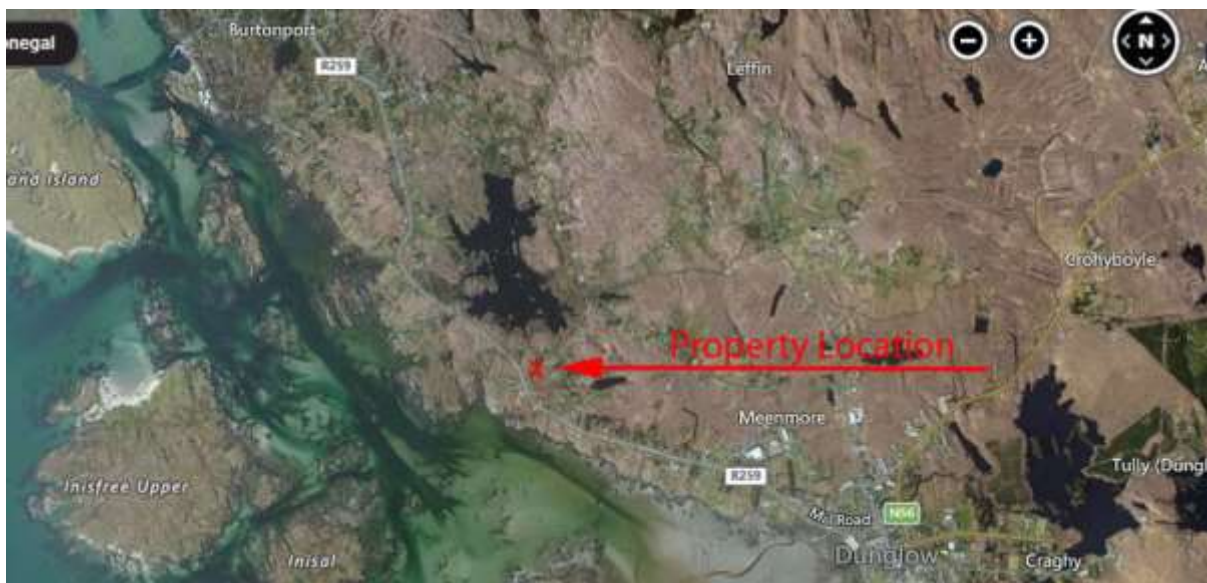
Aerial View of Property Location