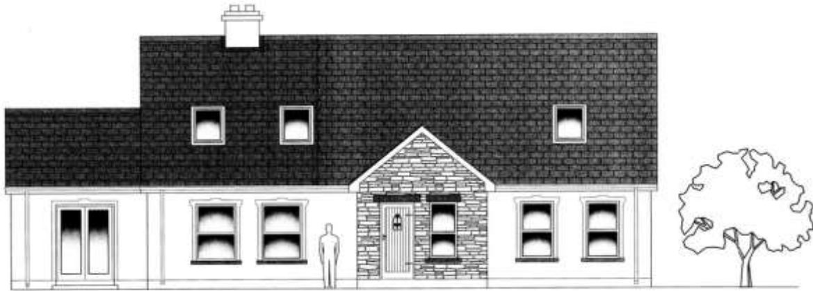
FRONT ELEVATION Front Elevation of Proposed House