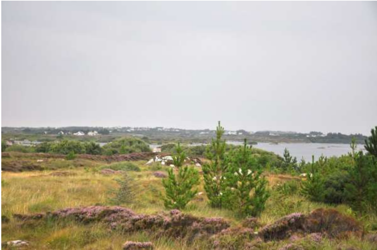
Lake View From Site